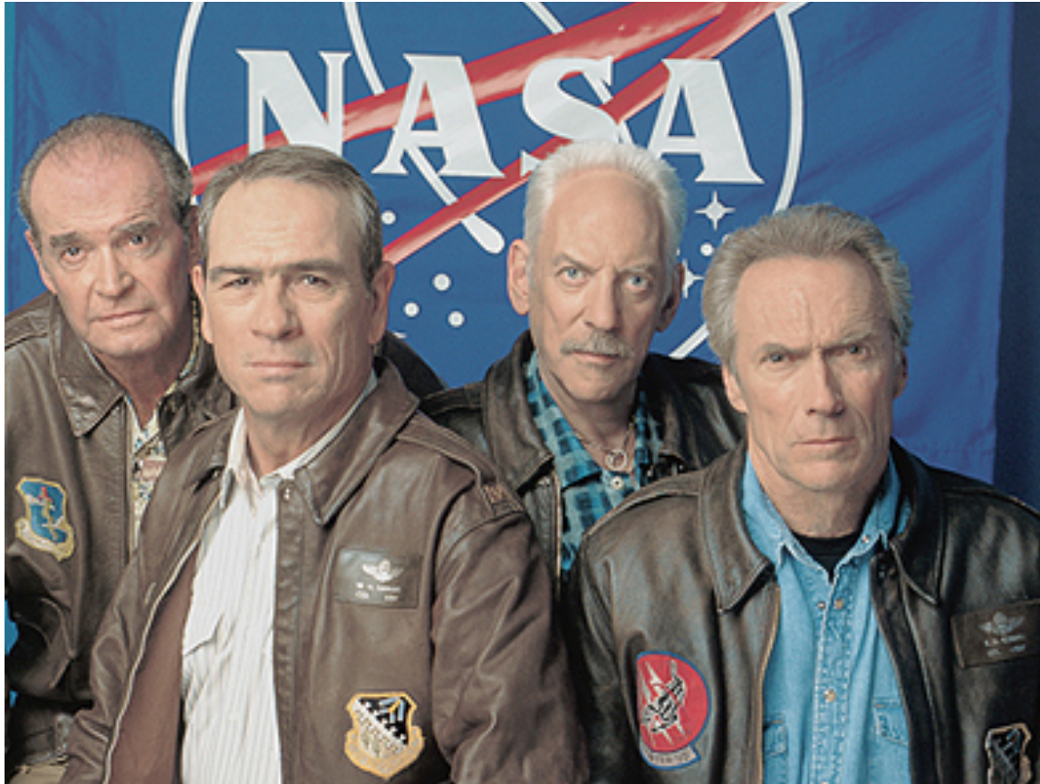
James Garner, Tommy Lee Jones, Donald Sutherland, Clint Eastwood